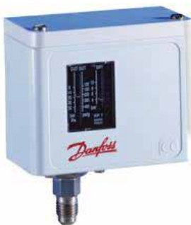
Danfoss Pressure Gauge