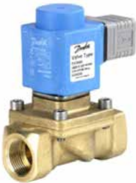
Danfoss Stop Check Valve